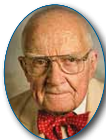
Charles B. Wheeler (Democratic)